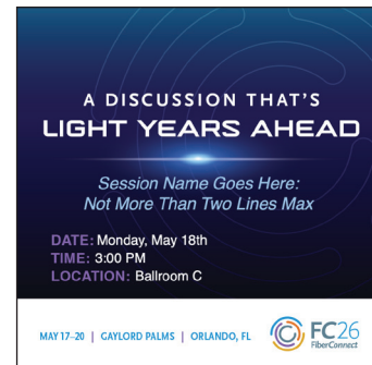
Layout C Customize: Session Information