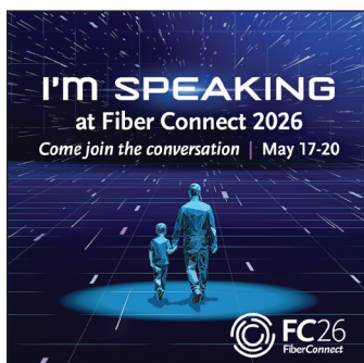
Layout D General Announcement

Simply use Layout D to announce your participation as a Speaker. Skip to Step 4 and choose post copy!