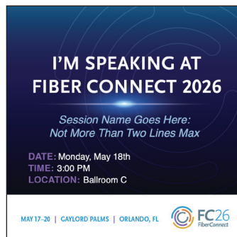
Layout B Customize: Session Information