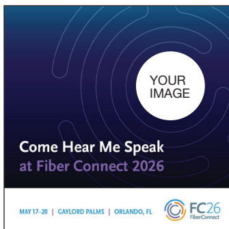
Layout A Customize: Headshot Only

We have created templates to use leading up to Fiber Connect — and also when you are at the show!