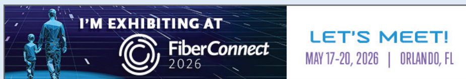
FC26 Exhibitor Email Tag (728 x 120)

Showcase your booth by adding the official FC26 event Email Signature/Footer to your daily communication. It's an easy way to let your entire network know exactly where they can find you, elevating your presence before the show. The more visibility you build now, the bigger the impact you'll make once there.